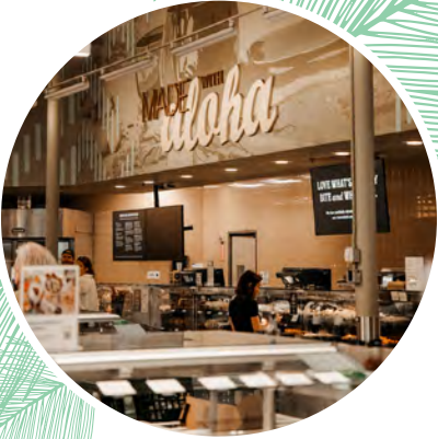
MAUI'S ONLY WHOLE FOODS MARKET