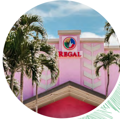
MAUI'S LARGEST MOVIE THEATER WITH STADIUM SEATING